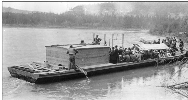
"The Beaver," a long narrow river boat which plied the Smoky River, ca. 1910 (SPRA 0155.03.10)