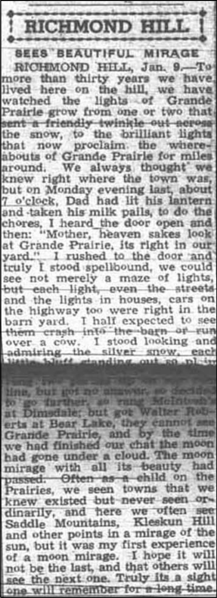
Grande Prairie Herald-Tribune January 16, 1947