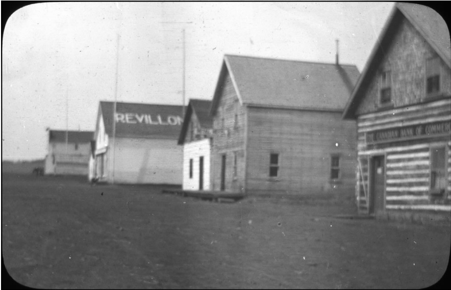
Above: Lake Saskatoon, ca. 1920 (SPRA 362.02.12.06)

I found this a beautiful rolling country, so different from the prairies, dotted with lakes and bluffs of