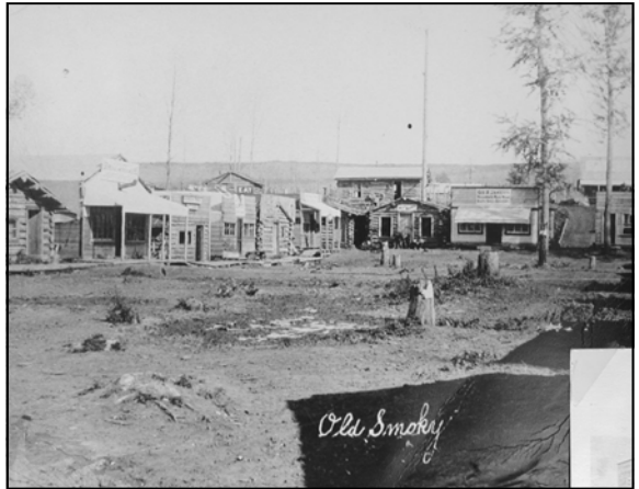
Row of log businesses, including pool hall, restaurants, and drugstore, which was Smoky River when it was the end of steel.

Of course the stories in Smoky Peace Triangle (where I found the information above) give a wonderfully human history of these three communities, but we would love to be able to preserve a more extensive record of this history with photographs and records from the businesses and families who once occupied Watino, Smoky River, or Pruden’s Crossing. Do you have, or know of anyone who has records relating to the history of this area that you could share? It would be a great 100 th birthday present for that community and historians in future generations.