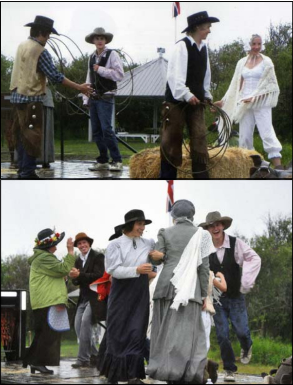
Above, the Harry Adair Campfire Play, first enacted in 2011, and below, the Adair Ranch at Scenic Heights ca. 1930.

Here's another chance to dress up in period costume, listen to music, and dance in the Pavilion.