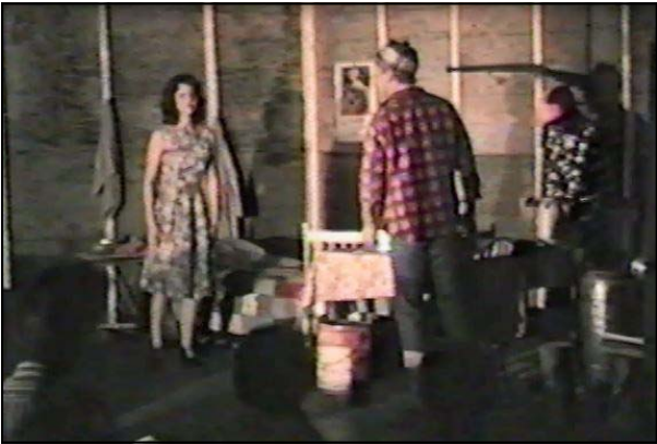
“I’ll Meet You in the Far Pasture” can be viewed on YouTube: https://www.youtube.com/watch?v=5CznTVfNjSI