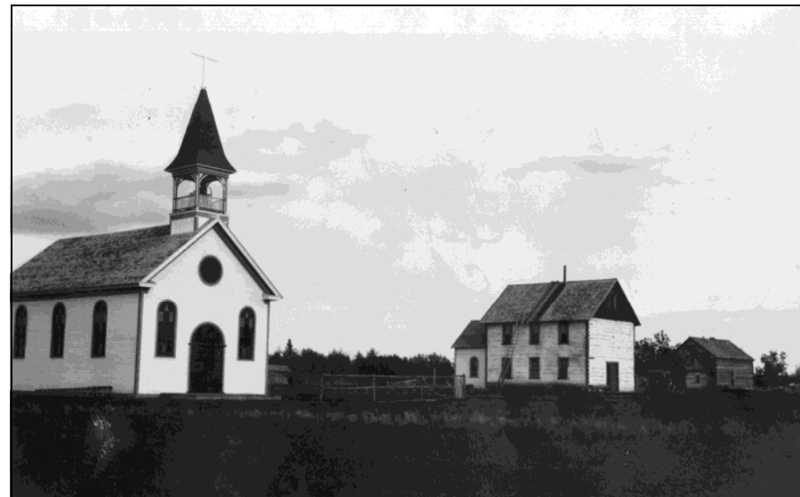
Above: The Catholic Mission at Spirit River Settlement. L-R the third church, the second church, and the first mission church. Date unknown.

As you curve north onto Rge Rd 54.2, you leave Spirit River Settlement and cross a railway track first laid in 1916 by the Edmonton, Dunvegan, and British Columbia Railway. This line spelled the death of the Spirit River Settlement. The regularly-spaced railway sidings, where people and freight could catch the train, became townsites with railway stations and grain elevators. A new townsite to the west was called Spirit River, and a new post office was immediately established there. Business and commerce soon followed. In 1920, the Settlement post office was moved to Rycroft. The school, established at the Presbyterian Mission in 1910, also moved to the Village of Rycroft, and re-named Rycroft School District 2109.