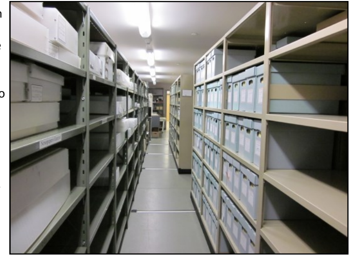
Archival storage at SPRA, taken in 2011.

Now you might be thinking, "With so many people able to access them, how safe are my records at the Archives?" SPRA takes numerous precautions to