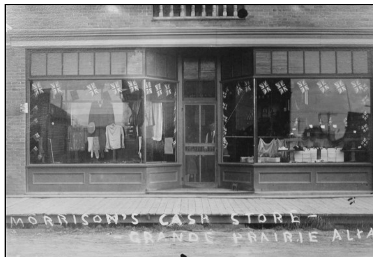
Morrison's Cash Store ca. 1925.

Once the order was assembled into an empty grocery box, paid for or put on credit till the fall harvest time, the customer took it home. I remember cash being in very short supply and suspect that most purchases at Morrison's General Store were on credit until harvest time. Many farm women had a butter press and prepared home churned butter and eggs to trade at Morrison's for other grocery items. Mom got 20 cents per pound for her butter and at the least 5 cents per dozen for eggs during summer peak production.