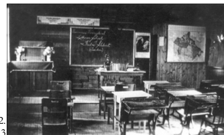
Emmaus Lutheran School, 1932.